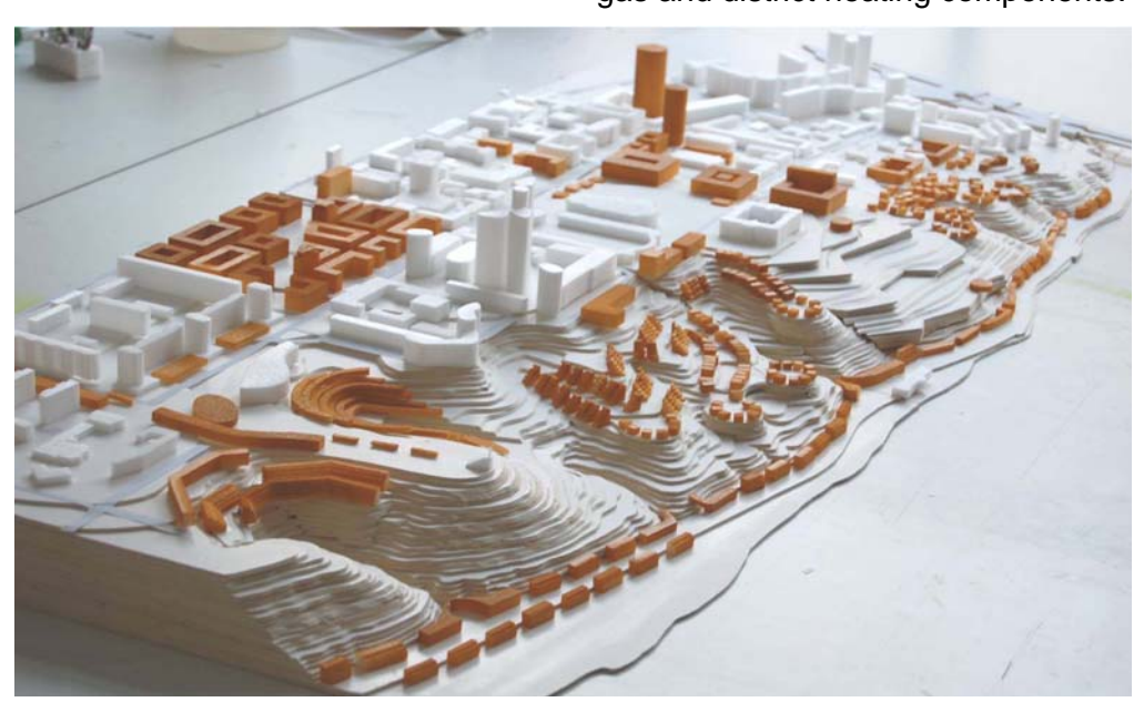
geospatial design model © as&p

It is planned to develop new residential and commercial areas on this embankment and to upgrade the adjacent urban areas and to develop a new city area on the opposite river banks. The geospatial master plan includes water supply, wastewater, stromwater, power, gas and district heating components.